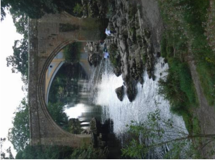
River Lune at Kirby Lonsdale

warm and the rain was soft, so we did the walk up to Friar's Crag following the side of the lake. We had checked the times of the launch on the lake, so decided that would be a good idea as the launch has an under cover section. We really enjoyed this trip, even in the rain, but the highlight was