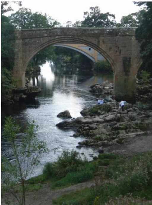
River Lune at Kirby Lonsdale

This year we hired a fairly new VW 9 seater for the Lake District trip which was a smooth ride and not so exhausting for the driver, but we still had the height to be able to see over walls and hedges. The morning was warm and sunny and the 'bacon butty' stop at Kirby Lonsdale, by the River Lune was no disappointment. We pressed on and arrived in Ambleside by noon. Our time around the town was sunny and we bought our fish and chip