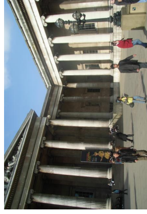
British Museum – Exterior View