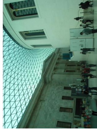
The Great Court

Whilst we were there we spent some time looking at some of the various treasures contained in the British Museum. The Elgin Marbles or Parthenon Sculptures brought back from Athens by Lord Elgin in the early 1800s