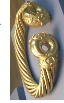
The Great Torc

I was struck by two other particular subjects. The first was The Great Torc, quite a small object but of great interest, found at Snettisham in Norfolk and dated at around 100BC. It was quite beautiful – solid but intricate and clearly of